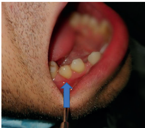
Figure 5. The supplementary tooth took place and function of a normal permanent premolar

decay and the inability to adequately maintain oral hygiene. Due to the same problem in area of the right lower premolars, he lost tooth 45, which was previously extracted as the patient states.