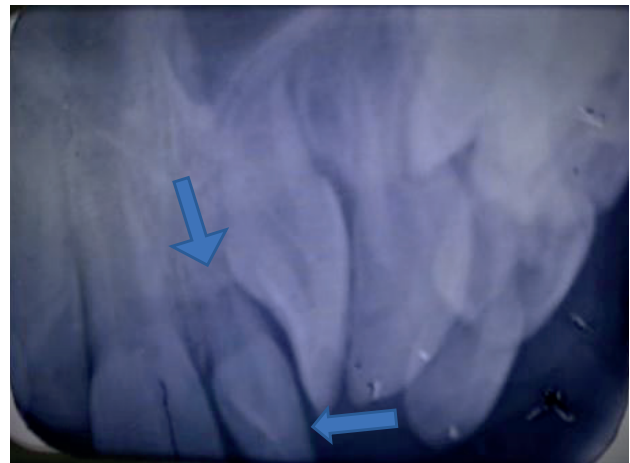
Figure 2. Radiographic image of a mesiodens, no other supernumerary teeth are visible