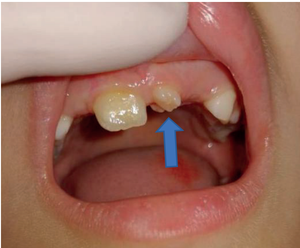
Figure 1. An image of mesiodens in a seven year old patient