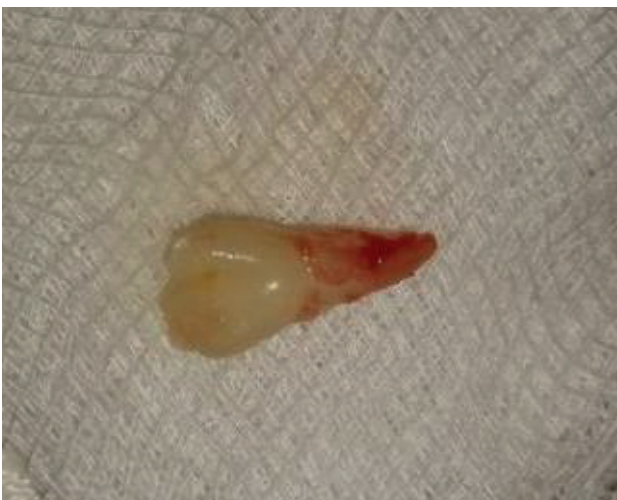
Figure 3. Mesiodens examined after extraction

and orally or vestibularly from the dentition peridens (peripremolar, perimolar). Excess teeth may be normally shaped (dentes supernumeraria) or may differ in appearance (dentes accessoria). They are often hypoplastic and can be placed inside or outside the dentition. The appearance of excessive teeth can interfere with the eruption and proper establishment of other teeth, create new retention sites for food and make it difficult to maintain adequate oral hygiene. Cystic formations can often develop around unexplained excess teeth (3).