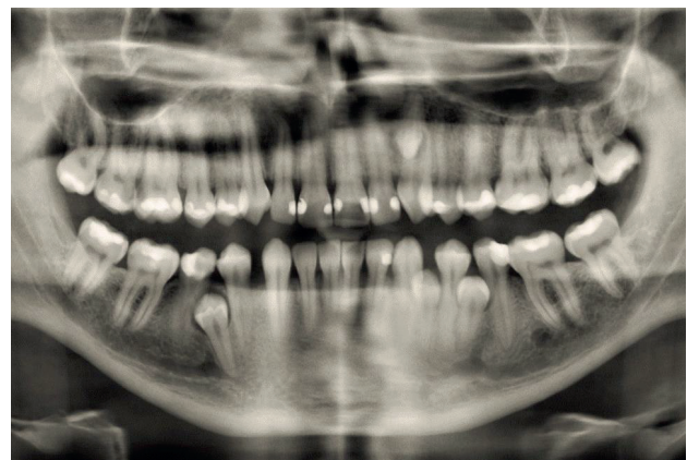
Figure 4. An image of orthopantomogram, showing supernumerary and supplementary teeth

- Tuberculate: tooth with several cusps. Its root is short and hooked (5).