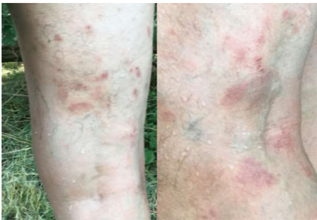
FIGURE 2 Maculopapular rash of the legs

Analysis of the data from retrospective studies highlights two clinical contexts where the effect of systemic corticosteroid therapy appears to be different: (a) at initiation or within the first 30 days of ICI treatment or (b) after the first 30 days for irAEs. The first situation concerns 12%-20% of patients, depending on the series, and the main indications are respiratory symptoms, fatigue, or brain metastases. In multivariate analyses, this corticosteroid therapy is associated with an increased risk of death, with a hazard ratio = 2.30, 95% CI (1.27-4.16), P = .006 in the study by Scott and Pennell, 19 and a hazard ratio = 1.66, 95% CI (1.28-2.16), P < .001 in the study by Arbour et al. 20 For patients with corticosteroid after 30 days of ICI, two studies on patients with advanced NSCLC treated with Nivolumab found that 15%-20% of patients presented irAEs that required corticosteroid therapy. Survival rate was comparable between patients with and without corticosteroid for irAEs (73% versus 71% at 6 months and 46% versus 45% at 18 months). 21 Similarly, the median OS was