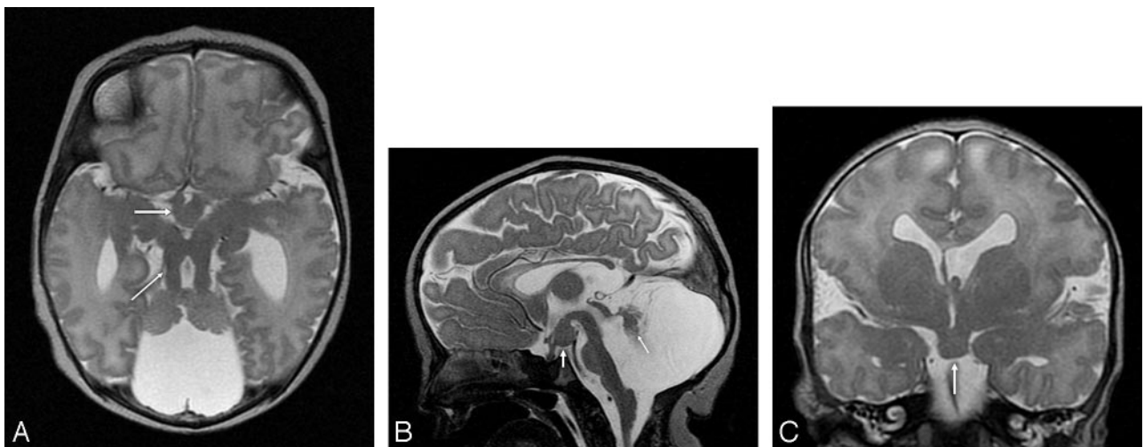
Fig 2. T2-weighted MR imaging at 2 days of age. A , Axial MR image showing hypoplasia of the vermis and both cerebellar hemispheres, the characteristic MTS ( thin arrow ) with thickened and elongated superior cerebellar peduncles, an abnormally deep interpeduncular fossa, and an HH ( thick arrow ). B , Sagittal MR image revealing significant hypoplasia of the cerebellar vermis and dysplasia of the remnants of the cerebellar vermis ( arrow ), an enlarged fourth ventricle and posterior fossa, and an HH ( white arrow ). In addition, the corpus callosum and the brain stem are hypoplastic, the pituitary stalk is thick, and the interthalamic adhesion is large. C , Coronal MR image demonstrating an HH ( arrow ), a missing left leaf of the septum pellucidum, a bulky left fornix, and a probably dysplastic cerebral cortex in the left Sylvian fissure.