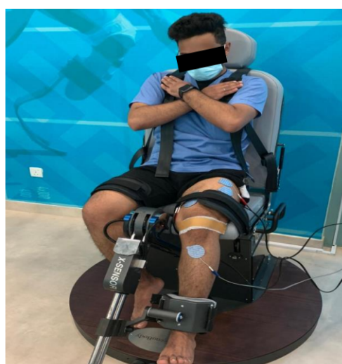
Figure 2. Measurement of maximal voluntary isometric contraction (MVIC) at 60° using ISOMOVE isokinetic dynamometer.

Participants were in a sitting position and stabilized with safety belts across the chest, thighs, and hips to avoid displacement; the shin pad was adjusted at 5.1 cm (2 inches) superior to the medial malleolus (as illustrated in Figure 2). Measurements were recorded from the participant's most affected leg, with the hip and knee angles set at 60° of flexion, as this position resulted in the most significant torque output [22]. Each participant received verbal instruction to keep their arm crossed over his chest and verbal encouragement to motivate them to attain maximal effort during the 5 s contractions. Each test included 3 consecutive 5 s trials with a 2 min rest between the trials. The mean score of three readings was used for statistical analysis.