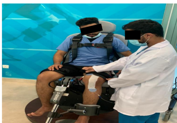
Figure 4. Application of nonrigid hypoallergenic tape (for placebo effect).

Subjects assigned to Group B were given the same set of exercises without EMG-BF. Nonrigid hypoallergenic tape (for a placebo effect) was applied on the skin in a vertical direction from the center of the patella while the participant was sitting with a flexed knee (as illustrated in Figure 4). However, electrodes were positioned away from the target muscles (e.g., VMO and RF). The reference electrode was positioned just below the tibial tuberosity. The participants received the placebo EMG-BF in which they performed quadriceps exercises with nonrigid hypoallergenic tape (placebo without rigid patellar taping) only, and they were not instructed to focus on the recruitment of VMO and RF muscle.