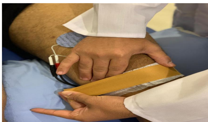
Figure 3. Application of McConnell taping.

In this group, participants received McConnell taping to correct the lateral and antero-posterior tilt and a medial patellar glide. It was applied distal to the patella to unload the infrapatellar fat pad (as illustrated in Figure 3). First, hypoallergenic underwrap tape was applied to prevent skin irritation; then, rigid (McConnell) tape was applied to maintain the patella by medially pulling the skin and patella [37]. Tape was removed after the outcome measure or if the participant experienced itching, redness, or discomfort.