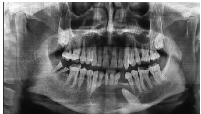
Figure 2: Photograph showing orthopantomogram with unilocular radiolucent lesion (arrow) with well-corticated border involving the left mandible. Extending from 34 to 44 with the impacted tooth (33)