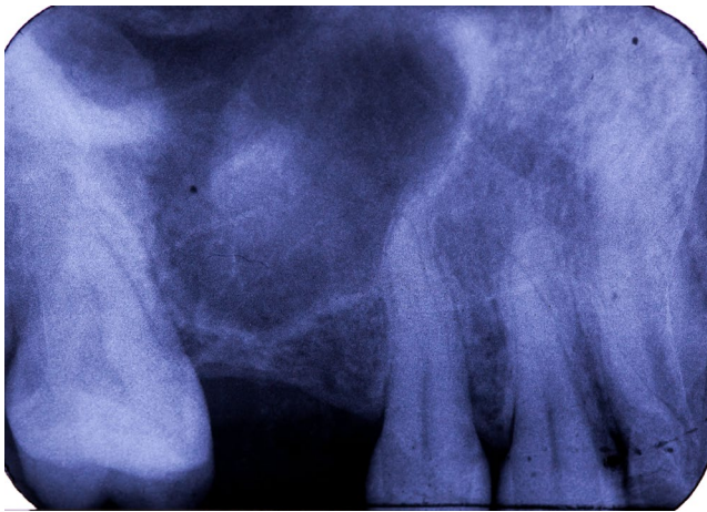
FIGURE 1 Preoperative retroalveolar radiography

Clinically, no horizontal defect was objectified, the present prosthetic space and keratinized tissue were sufficient. A panoramic radiograph (OPG) and a Cone beam computed tomography (CBCT) were prescribed and showed a severe vertical defect with a residual ridge height of 2 mm.