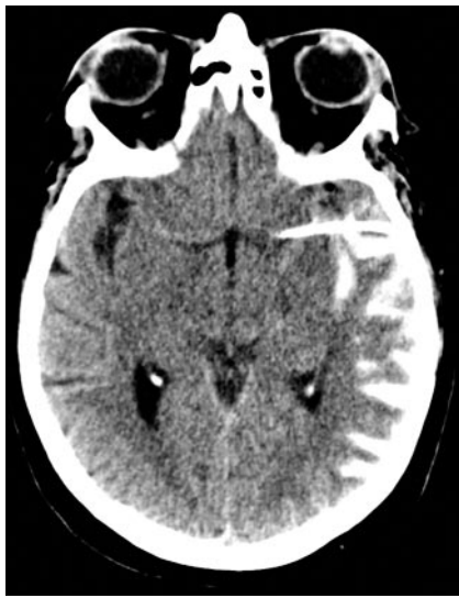
Fig 2. Immediate CT showing contrast extravasation into the subarachnoid space.