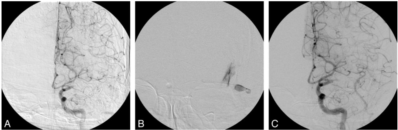
Fig 1. A–C, Anteroposterior view of the left common carotid artery with occlusion of the left M1 (A) with pial collaterals. After passing the clot, anteroposterior view of microcatheter injection (B), showing contrast extravasation in the subarachnoid space. (C) After microcatheter perforation, left internal carotid artery injection, showing absence of contrast extravasation.