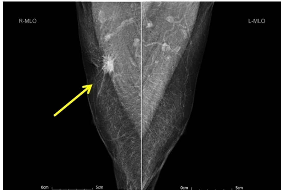
FIGURE 1: Bilateral mammogram (mediolateral oblique view) showing a 25-mm suspicious lesion in the right breast axillary tail (yellow arrow).