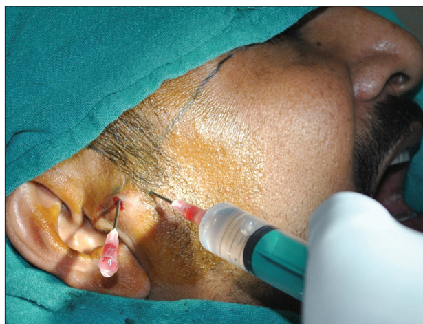
Figure 2: Arthrocentesis of Temporomandibular Joint