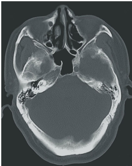
FIGURE 3 Follow-up computed tomography scan performed after surgery

symptoms completely disappeared immediately after surgery for sinusitis and never returned over the subsequent 6 years.