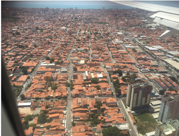
Fig. 1 The core chessboard layout of Fortaleza