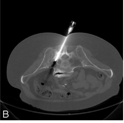
Fig 1. CT images from needle placement in 2 different patients with sacral insufficiency fractures illustrating the possible orientation for the bone biopsy needle(s) in the sacrum.