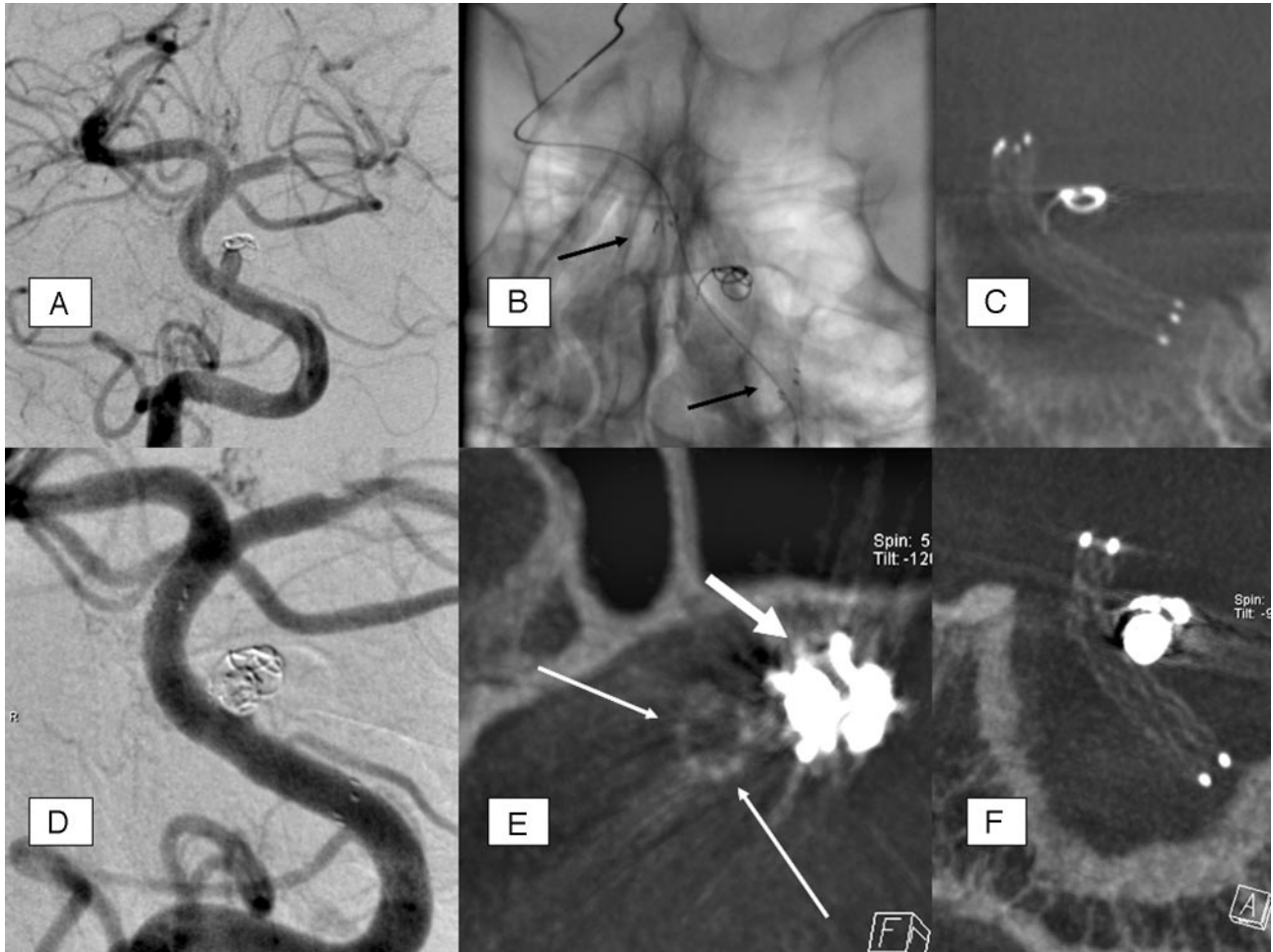
Fig 1. A, The basilar stem aneurysm showed complete occlusion initially after insertion of a single coil 2.5 mm in diameter; coil compaction and significant aneurysm growth in 6-month follow-up-DSA. B, Unsubtracted DSA image after insertion of a Neuroform stent (4 × 20 mm) shows the proximal and distal radiopaque markers of the stent (arrows); the stent itself is not visible. C, MIP reconstruction of ACT performed after stent deployment and before second coil embolization: excellent stent visibility and regular, complete stent deployment. The initially inserted single coil shows compaction and is distant to the parent (basilar) artery and to the stent struts as well, including one coil loop with position adjacent to stent wall, with definite extraluminal position. D, DSA. A total of 4 platinum microcoils (diameters, 2.5 and 2.0 mm, respectively) were additionally inserted. The basilar stem aneurysm shows satisfiable occlusion with minimal dog-ear remnant. E, Axial, thin (1 mm section thickness) MPR reconstruction of ACT performed after stent deployment and second coil embolization (same dataset as in F). This reconstruction allows definite exclusion of stent strut movement or coil protrusion: stent (thin arrows) without deformation adjacent to coil package (thick arrow), which causes some beam-hardening artifacts. F, MIP reconstruction (oblique coronal) of ACT performed after stent deployment and second coil embolization: excellent stent visibility without significant limitation by marginal beam-hardening artifacts through coil package; no change of stent configuration compared with the ACT imaging before the second coil embolization.

cranial hemorrhage in all of the cases confirmed by early MR imaging within 3 days after intervention.