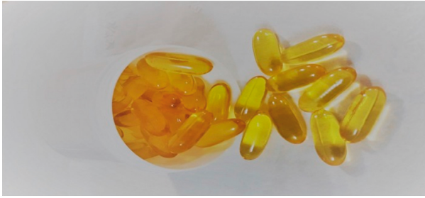
FIGURE 1: Cinnamon oil soft capsules.

used a random number table. Odd number was allocated to an intervention group and even number was allocated to the placebo group. The capsule box of both groups looked identical, so in addition to the physicians and researchers, the patients were also blinded to the drug allocation. Figure 2 shows a flow chart of the trial procedure.