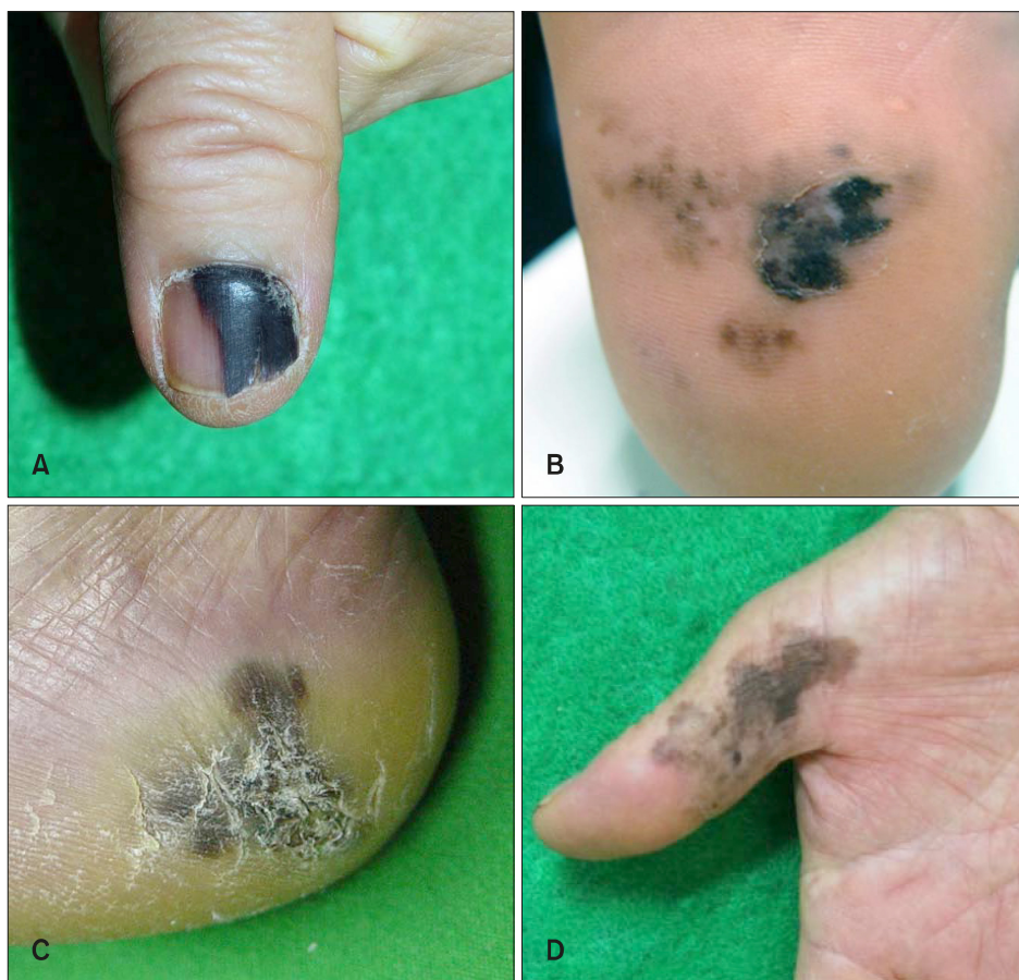
Fig. 2. Clinical findings of acral melanoma according to a history of trauma, physical stress, and occupation in agriculture and the fishery industry. (A) A 78-year-old female hit her left thumbnail with a hammer. (B) A 57-year-old male stepped on a stone with his heel. (C) A 69-year-old male continuously scrubbed and abraded the keratoderma and callus on his heel. (D) A 67-year-old female was a farmer and the site of the melanoma had been chronically irritated by a farming tool while working. We received the patient’s consent form about publishing all photographic materials.