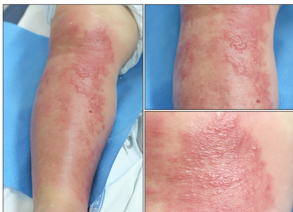
Fig. 1. Painful and tender, ill-defined, erythematous edema with multiple vesicles on the right lower leg for 3 days. We received the patient's consent form about publishing all photographic materials.