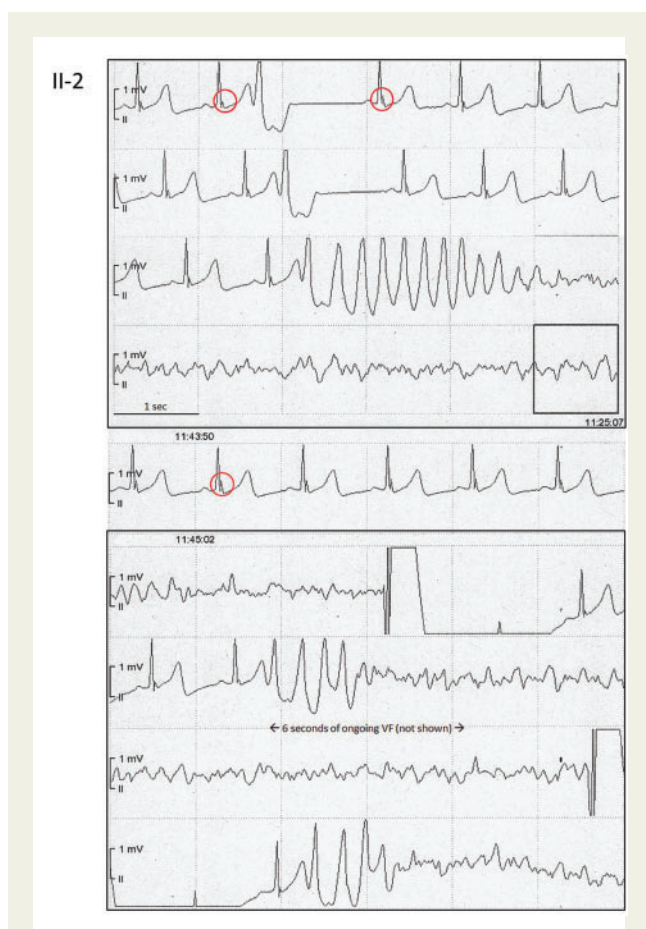
Figure 2 Electrical storm with dynamic early repolarization. Continuous electrocardiographic tracings from the telemetry monitor in the index patient: lead II demonstrates a distinct inferior J-wave with pause-dependent augmentation (red circles) and a monomorphic short-coupled premature ventricular complex triggering polymorphic ventricular tachycardia that rapidly degenerates into ventricular fibrillation. A further increase of the J-wave amplitude (red circles) precedes recurrent ventricular fibrillation. Following each defibrillation there is instantaneous ventricular fibrillation recurrence after four, respectively, two normal beats triggered by the very first monomorphic premature ventricular complex, resulting in three ventricular fibrillation episodes within 30 s. After this last defibrillation, the patient remained in ongoing VF for >1 h due to intractable ventricular fibrillation while being protected by venoarterial extracorporeal membrane oxygenation (VA-ECMO).

(‘non-diagnostic’ ERS score of 2 points). We did not perform Ajmaline challenges in the parents due to the negative Ajmaline test results in both siblings.