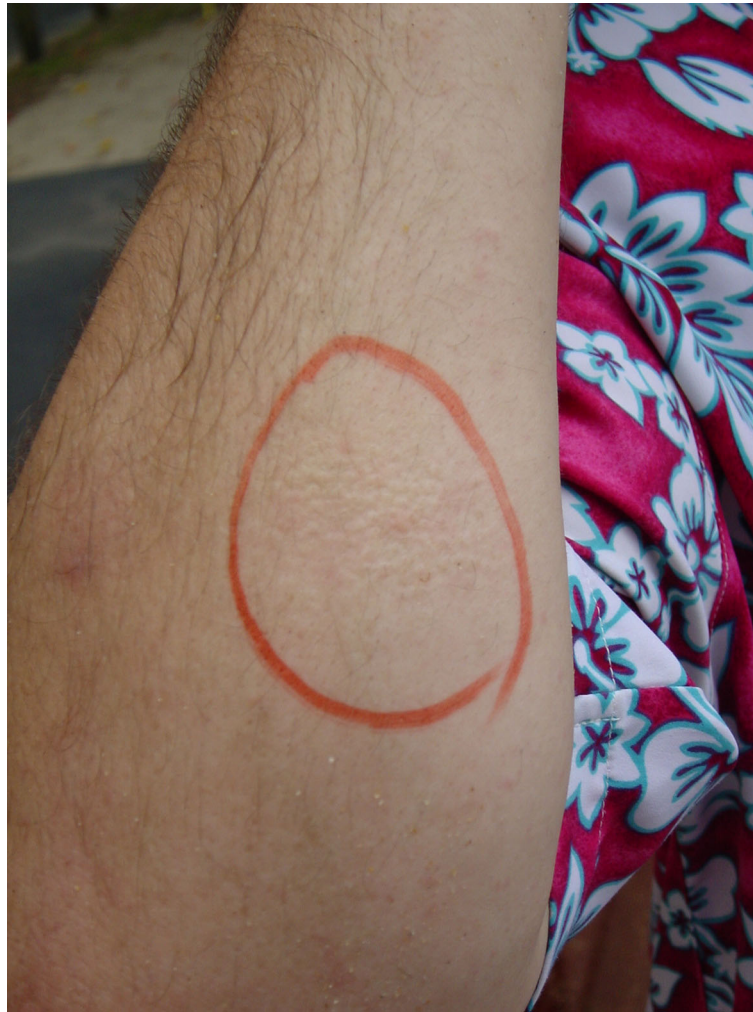
FIGURE 2 | Local response to C. barnesi envenomation. Image showing a typical dermal reaction on the arm following a sting from a C. barnesi jellyfish. The red marker indicates the sting site.

contributes to the positive feed-forward cytokine dysregulation seen in CRS (206). Encouragingly, the blockade of \alpha_1 -adrenergic receptors (also expressed on immune cells) or the inhibition of tyrosine hydroxylase (required for catecholamine biosynthesis) by prazosin or metyrosine hindered the self-amplifying proinflammatory loop in vitro and in vivo (206).