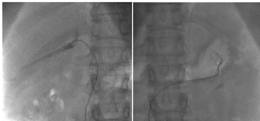
Figure 2. Radiologic aspect during catheterization of the suprarenal veins.