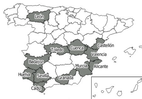
Figure 1. The Spanish provinces where the sampled farms were located.

Samples were collected from 39 laying hen farms, between April and November 2018, located in 12 provinces of the six Spanish regions that produce 62% of Spanish eggs [8] (Figure 1). The breeding, biosecurity, and biosafety practices and protocols were similar between the studied farms. Sampling was carried out during the 40 and 50 laying weeks [26]. All the farms that participated in the study used cage systems to keep the hens.