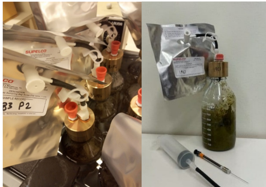
Figure 1. Modified in vitro system for determination of long term methane emissions from feces (nine weeks incubation).