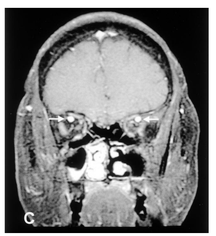
Fig. 1. The SOVs (arrows) are located under the superior rectus muscles. Three examples of the diameters of the SOVs are illustrated. A, SOV 1 mm in diameter in a 57-year-old woman with a CSF pressure of 108 mm H<sub>2</sub>O.

B, SOV 3 mm in diameter over the left side and SOV 2 mm in diameter over the right side in a 32-year-old women with a CSF pressure of 230 mm H_2O .