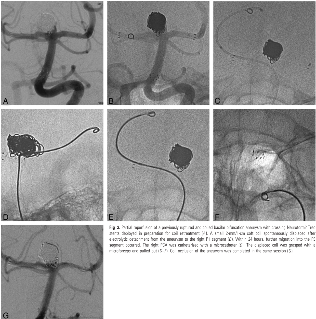
Fig 2. Partial reperfusion of a previously ruptured and coiled basilar bifurcation aneurysm with crossing Neuroform2 Treo stents deployed in preparation for coil retreatment (A). A small 2-mm/1-cm soft coil spontaneously displaced after electrolytic detachment from the aneurysm to the right P1 segment (B). Within 24 hours, further migration into the P3 segment occurred. The right PCA was catheterized with a microcatheter (C). The displaced coil was grasped with a microforceps and pulled out (D–F). Coil occlusion of the aneurysm was completed in the same session (G).

was held in place and the microcatheter was slightly advanced to close the jaws. The coil was grasped with the first attempt and was apparently firmly held. While maintaining constant slight tension on the Alligator, it was pulled back together with the microcatheter as a unit into the guiding catheter. Pulling back of the coil even through the struts of the 2 crossing stents was possible without any difficulty (Fig 2F). The aneurysm was then catheterized with the RapidTransit microcatheter, and complete occlusion was achieved (Fig 2G).