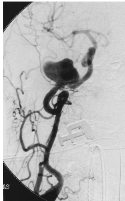
FIG 3. Case 2. Image from a right common carotid artery injection reveals a lobulated 3-cm aneurysm of the petrous segment of the ICA.

A 54-year-old man presented to the emergency department at our institution unresponsive and markedly hypotensive with severe bleeding from his mouth and nose. Examination revealed hemorrhage from the opening of his right Eustachian tube, and packing of that area resulted in cessation of the hemorrhage following loss of nearly 10 U of blood. His past history was remarkable for sinusitis and ear infections involving