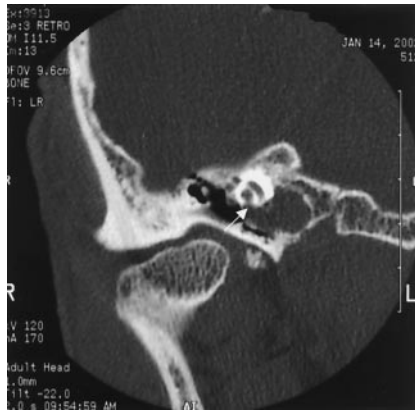
FIG 1. Case 1. Coronal CT image through the right temporal bone demonstrates an erosive lesion involving the posterior wall of the right petrous carotid canal with erosion into the cochlea (arrow).