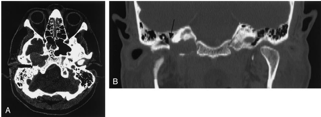
FIG 4. Case 2. Unenhanced axial (A) and coronal (B) CT images demonstrate a large slightly hyperattenuated soft-tissue mass with smooth scalloped margins, measuring 3 cm in diameter expanding the petrous carotid canal with erosion of the medial wall of the middle ear (arrow).