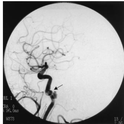
FIG 2. Case 1. Image from a right common carotid artery injection demonstrates an aneurysm of the horizontal petrous ICA segment (arrow).

case report. These cases illustrate the spectrum of otologic symptoms with which petrous aneurysms may present. These symptoms include hearing loss, tinnitus, and life-threatening hemorrhage.