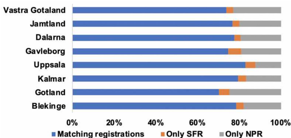
Figure 2 Calculation of completeness in the SFR (Swedish Fracture Register; attached counties) and NPR (National Patient Register) in 2016–2018 according to the adjustment algorithm.

Sahlgrenska University Hospital showed a lower completeness level than the NPR (88%) but a perfect PPV (100%) for acute humeral fractures. This demonstrates that it is possible to achieve valid registrations in a NQR based on voluntary means.