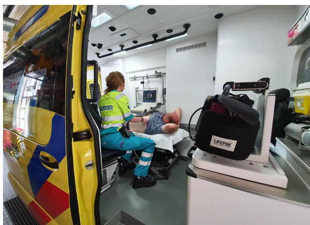
Fig. 2 Portable ultrasound system mounted inside the ambulance enables diagnostic and therapeutic echocardiography (sonothrombolysis) during patient transfer to the PCI centre

Contrast-enhanced echocardiography will be performed 3–4 months after initial presentation. Left ventricular function and volumes will be measured. Left ventricular remodelling will be defined as a 20% increase in end-diastolic volume at the 3 month follow-up biplane contrast-enhanced echocardiogram compared with the pre-discharge echocardiogram.