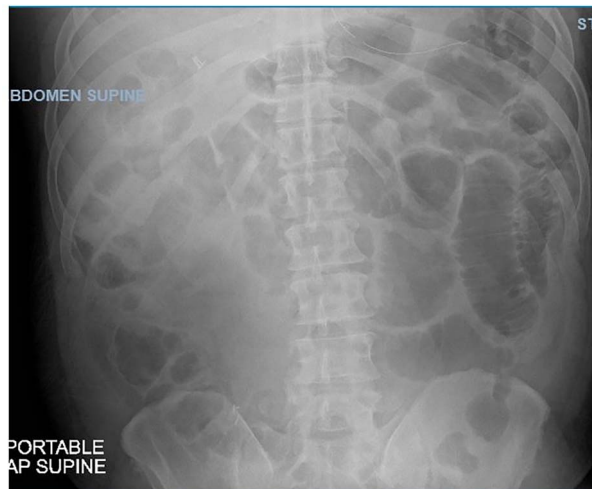
Figure 2: Abdominal X-ray showing dilated loops of bowel on Day 9 of admission.

Postoperatively, the patient remained NPO with an NG tube for 8 days. On Day 9, his abdominal X-ray (Fig. 2) was much improved and without air-fluid levels, he was passing flatus, and his abdominal exam was clinically benign. He was started on a clear liquid diet and advanced to a regular diet over the next day. The patient was discharged 13 days after the admission. He was