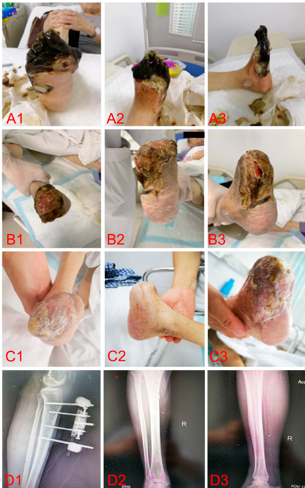
(caption on next page)