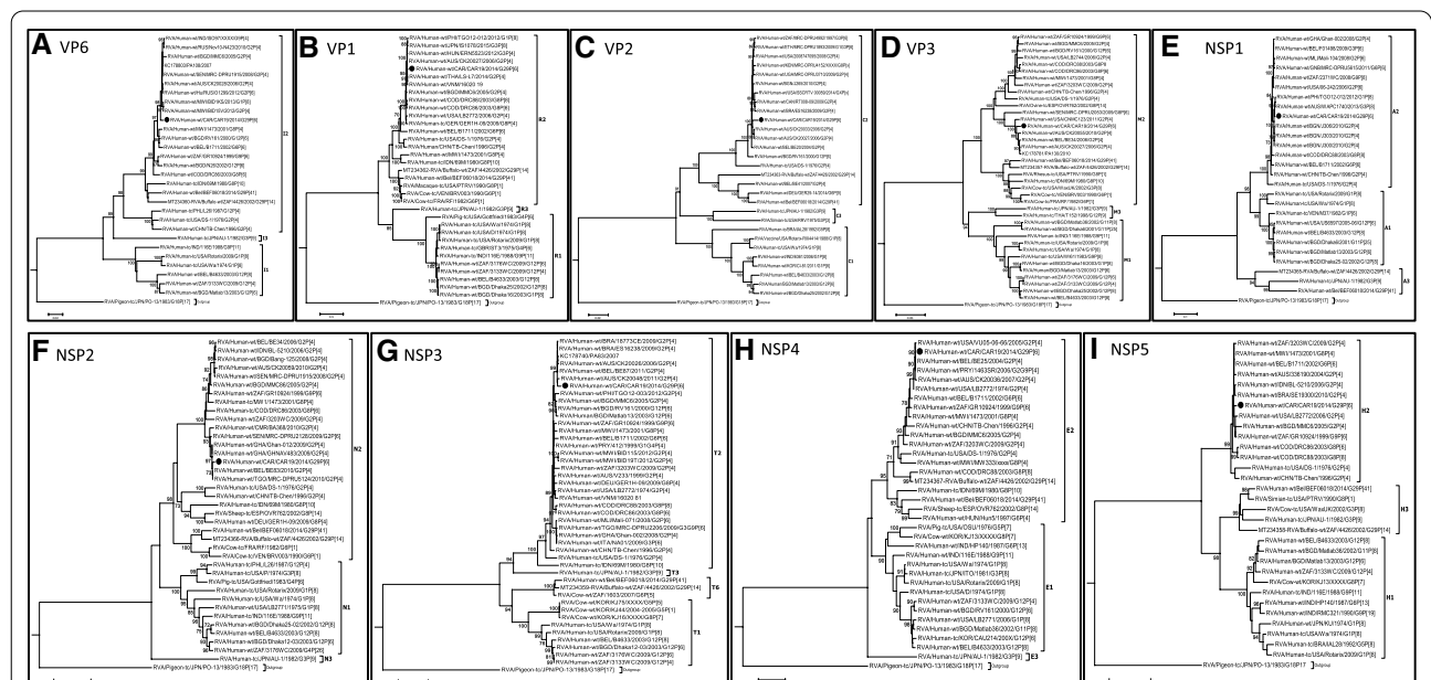
Fig. 2 A–I Phylograms indicating genetic relationships of complete nucleotide sequences of A VP6, B VP1, C VP2, D VP3, E NSP1, F NSP2, G NSP3, H NSP4 and I NSP5 of the study strain RVA/Human-wt/CAR19/2014/G12P[6] from Central African Republic (indicated with a black circle) with representatives of known human and animal rotavirus genotypes. Bootstrap values > 70% are indicated at each branch node. Scale bars indicate the number of nucleotide substitutions per site

genogroup 2 strains belonging to the R2, C2, I2, A2, N2, T2, and H2 genotypes, respectively (Fig. 2A–I). The only closely related non-human strain sequences were the VP3 and NSP4 genes of ovine, buffalo and cow RVA strains RVA/Sheep-tc/ESP/OVR762/2002/G8P[14], RVA/Buf-falo-wt/ZAF/4426/2002/G29P[14] and RVA/Cow-tc/VEN/BRV003/1990/G6P[1]. However, the VP1, VP2, VP3, VP6, NSP1, NSP2, NSP3, and NSP5 gene segments of strain CAR91/2014 shared greatest nucleotide (90–100%) and amino acid (93–100%) identities with