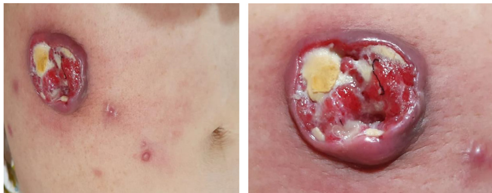
Fig. 1 – Erythematous and ulcerated plaque with superficial erosions associated with satellite indurated nodules.