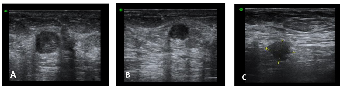
Fig. 3 – Two irregular hypoechoic suspicious lesions (A,B) in the upper outer right quadrant with lateral attenuation, measuring 12 \times 13 mm and 10 \times 9 mm classified as Birads 4 with right axillary adenopathy suspicious of malignancy (C) .

Cutaneous metastases have several aspects and nodules are the most common presentation. Metastatic nodules are generally few in number and may adopt a regional grouping that varies depending on the nature of the primary cancer. They are firm and usually painless [4]. The histological and