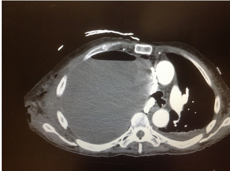
FIGURE 2: CT scan of the chest cavity. The arrow indicates one of the air-fluid level in the empyema necessitans.