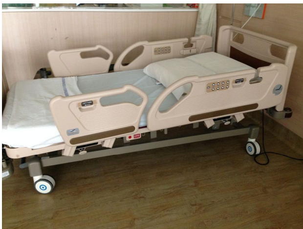
Fig. 1 Reverse Trendelenburg position or whole bed tilt

infections either prior to hospital discharge or administered 2–6 weeks after discharge in those with an episode of sepsis during their hospital admission. On discharge, patients were advised to prop their heads up on pillows when sleeping, and to avoid lying flat for an hour after meals, to reduce the risk of gastric aspiration.