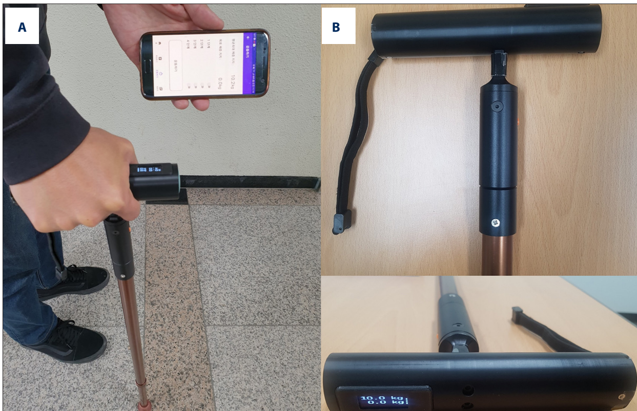
Figure 2. A weight support feedback cane (WSFC). The WSFC measures the cane dependence by a load cell located at the bottom of the WSFC handle, and the measured cane dependence is displayed on the WSFC handle (A) and smartphone application in real time (B).

is a portable and wireless system with wearable sensors. The wearable sensor was attached at the first sacrum level of the subjects using a semi-elastic belt. All acceleration data (velocity, cadence, single-limb support phase of the affected side, and symmetry index) were transmitted via Bluetooth to the special software program G-Studio (BTS Bioengineering, Milano, Italy).