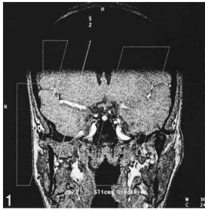
FIG 2. Coronal-plane MR image (patient 5), chosen to localize the M1 segment and the optimal MCA cross-section plane.