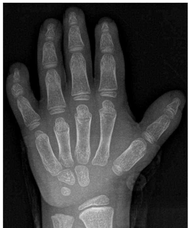
Figure 3. Frontal left-hand radiograph showing small middle phalanx of the little finger causing shortening and curvature of the little finger.

A likely pathogenic variant in the ADAMTS10 gene, c2050C>T p(Arg684*) had been previously detected in a homozygous state in a relative of the patient. Through targeted genetic testing in the patient, the same familial variant in the ADAMTS10