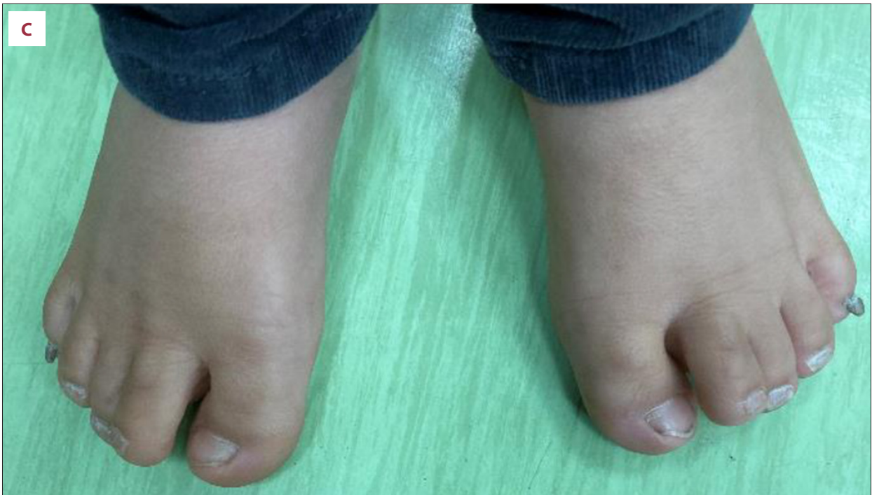
Figure 2. (A) Frontal and lateral photograph of the patient with WMS. (B) Photograph of the hand of the WMS patient showing short hands and stubby fingers (brachydactyly), as well as curvature of the fourth and little fingers (clinodactyly). (C) Photograph of the foot of the patient with WMS showing short toes and overlapping second and third toes. WMS – Weill-Marchesani syndrome.

disproportionate severe short stature (short limbs), brachydactyly (broad short fingers and toes), and clinodactyly, with an overlap of the second and third toes bilaterally. He had broad hands, joint stiffness, and a wide carrying angle of the elbow (Figure 2A-2C). The skeletal survey revealed a small middle phalanx of the little finger, causing a shortening of the little finger (Figure 3). Cardiac auscultation revealed no murmur and normal cardiac sounds.