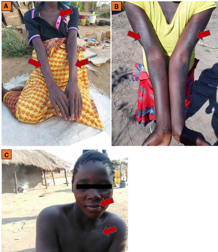
FIGURE 1. Pictures of patients with dermatological signs characteristic of pellagra at the time of case detection during an outbreak in Mozambique. Arrows indicate typical dermatological features of pellagra cases identified during the outbreak in Mozambique. Skin lesions are observed in (A and B) arms, (A, B, and C) chest (with typical Casal's neck appearance), and (C) face. This figure appears in color at www.ajtmh.org .

diarrhea, and none was hospitalized. Cases were more likely to be female ( P < 0.01 ) and less educated ( P < 0.01 ) than controls (Table 1). Insufficient consumption of chicken (gender-adjusted OR = 2.04; 95% CI: 1.16–3.58) and peanut (gender-adjusted OR = 1.8; 95% CI: 1.02–3.17) before cyclone Idai arrival was associated with pellagra (Table 2).