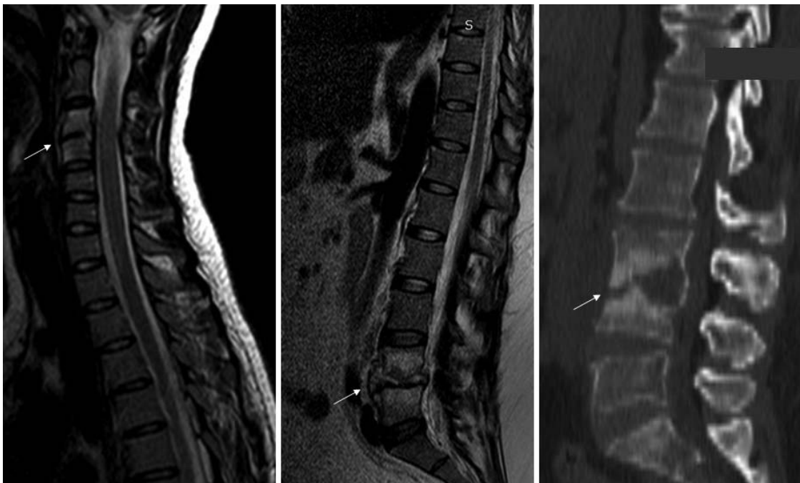
Figure 1. Example of grade I pyogenic spondylodiscitis (PS) at C3 to C4 level (arrow) on magnetic resonance imaging (MRI; left), grade II PS at L4 to L5 level (arrow) on MRI (center), and grade III PS at L3 to L4 level (arrow) on computed tomography scan (right).

The mean pretreatment COMI score of 7.3 \pm 0.7 significantly decreased to 6.1 \pm 0.9 ( P < .0001 ) at 6 weeks, to 2.5 \pm 1.5 ( P < .0001 ) at 3 months, to 0.5 \pm 0.6 ( P < .0001 ) at 6 months, and to 0.2 \pm 0.2 ( P < .0001 ) at 12 months after treatment (Figure 3). The mean pretreatment ESR level significantly