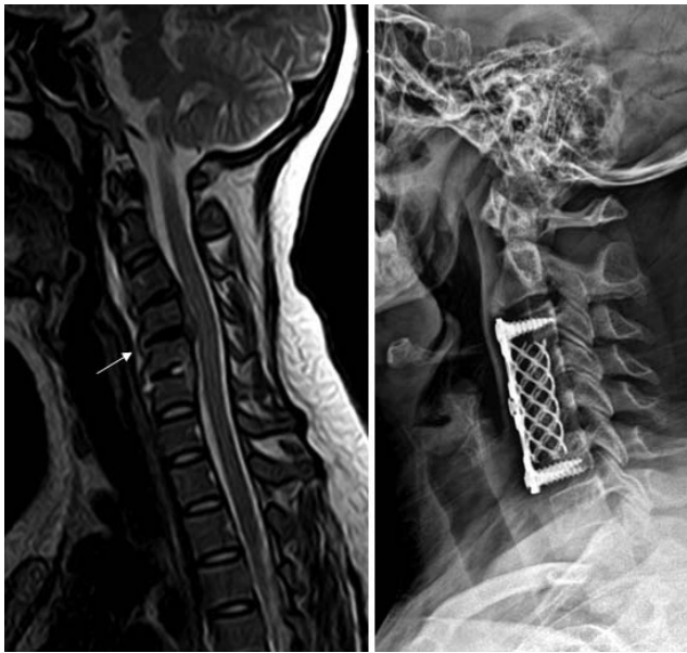
Figure 2. Preoperative cervical spine magnetic resonance image of a patient with grade III pyogenic spondylodiscitis at the C4 to C6 levels (left) and cervical spine lateral radiograph of the same patient at 12 months after anterior cervical corpectomy and fusion surgery (right).

decreased at 6 weeks ( P = .02 ), 3 months ( P < .0001 ), 6 months ( P < .0001 ), and 12 months ( P < .0001 ) after treatment (Figure 4). Similarly, the mean CRP value significantly decreased at 6 weeks ( P < .0001 ), 3 months ( P < .0001 ), 6 months ( P < .0001 ), and 1 year ( P < .0001 ) after treatment when