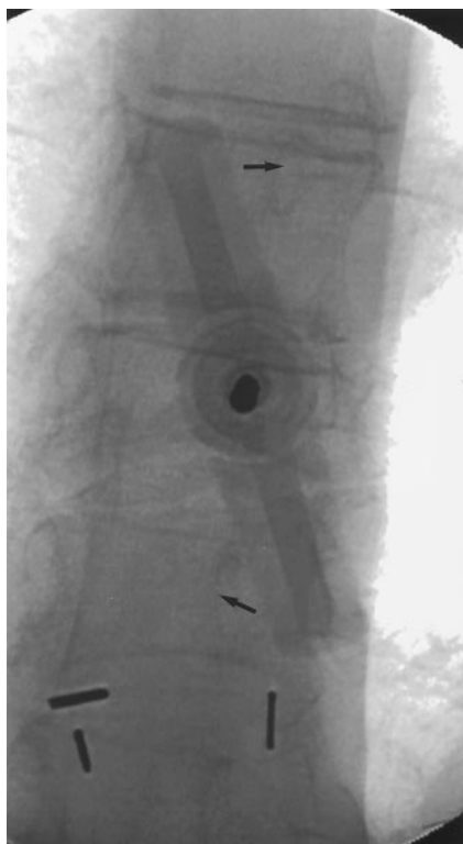
FIG 1. Oblique anteroposterior view during needle placement. The anteroposterior tube is aligned parallel to the axis of the needle. The hub of the needle obscures the pedicle at the treatment level; however, its position can be estimated by viewing the ipsilateral pedicles at levels immediately above and below (arrows). Note that the angulation of the anteroposterior tube projects into the ipsilateral pedicles approximately 25% medial to the lateral edge of the vertebral body.

initially determined using the lateral tube. To facilitate placement of the needle tip near the midline so that a single injection could be used to fill both portions of the vertebral body, the anteroposterior tube typically was angled approximately 20 degrees lateral to the vertebral body (Fig 1). This angulation of the tube projects the ipsilateral pedicle approximately 25% medial to the lateral edge of the vertebral body. The needle was advanced until its tip rested in the anterior third of the vertebral body (Fig 2).