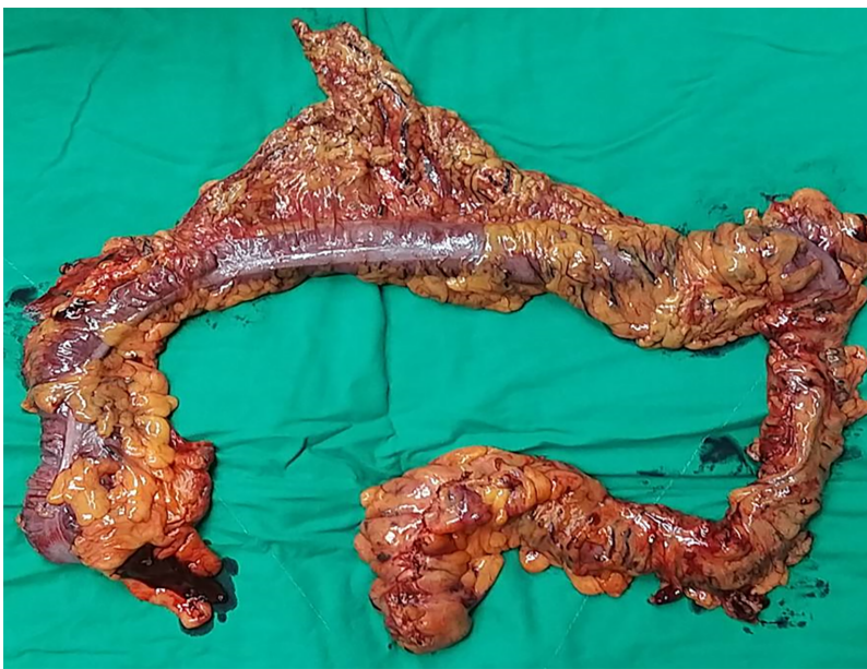
Figure 2 Specimen after laparoscopic-assisted subtotal colectomy.

colectomy in STC patients. We observed no AL in our 32 STC patients who underwent an SRA-sparing operation. Although our study had a small sample size, the preservation of the SRA seems to have an excellent surgical outcome.