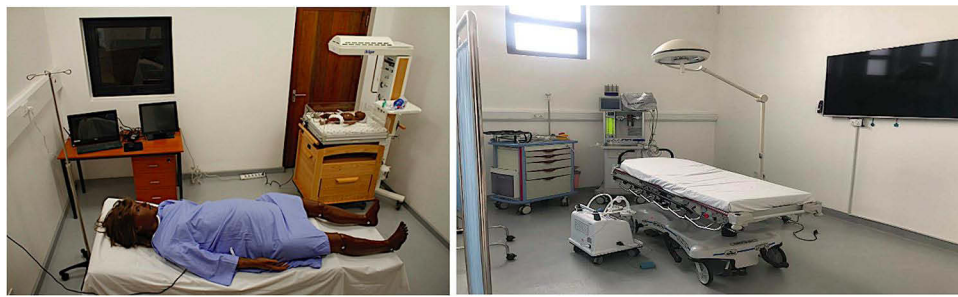
Figure 4 Medical education simulation facility setup at the UGHE.

simulator or high-fidelity simulators. This method engages computerized systems to control full-body manikins that are programmed to give realistic physiologic responses to learners' actions [Figure 4]. As such, these manikins can demonstrate physiological and pathophysiological processes normally, and in response to interventions, making them highly useful to teach complex phenomena and to integrate several dimensions of basic medical sciences in single sessions. The manikins can breathe and talk, sleep-and-wake up, for instance, they are also capable of delivering babies, bleeding, and making vomitus. They can be used to learn and manipulate almost all major vital and physiological signs, such as the pulse, heartbeat, ECG among others. All these features allowed for a better presentation of structures, functions, symptoms and medical skills to learners. 24