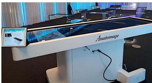
Figure 3 The Anatomage Table 7 for Anatomical dissection, physiological/functional simulation, demonstration and teaching facility.