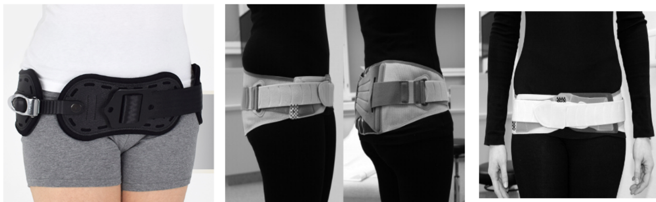
Figure 1. Proper positioning of the pelvic belt.