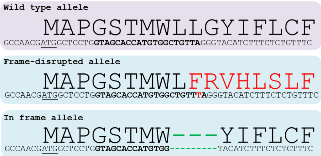
Figure 2. Examples of indels generated by CRISPR at the beginning of the coding region of rabbit ZP4 gene. Wild-type, frame-disrupted and in frame alleles are shown. For each allele, amino acid sequence is depicted in big letters that match the codons situated below, start codon (ATG) is underlined and CRISPR target site is marked in bold letters. On the frame-disrupted allele, a insertion of a single base (red T) disrupt the amino acid sequence beyond that point. In contrast, a in frame indel consisting in a 9 bp deletion only eliminates 3 amino acids, leaving the rest of the sequence unaltered.