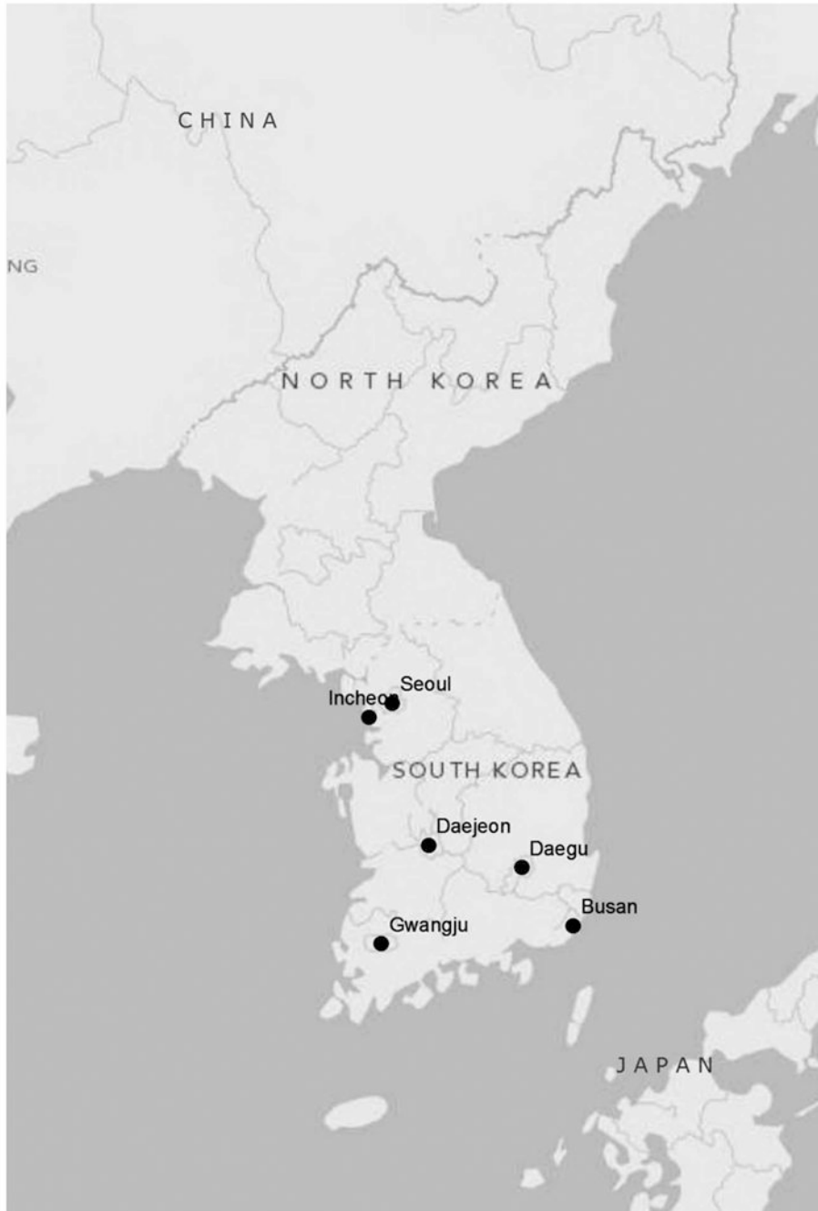
FIGURE 1 | Location of six major cities in South Korea included in this study.