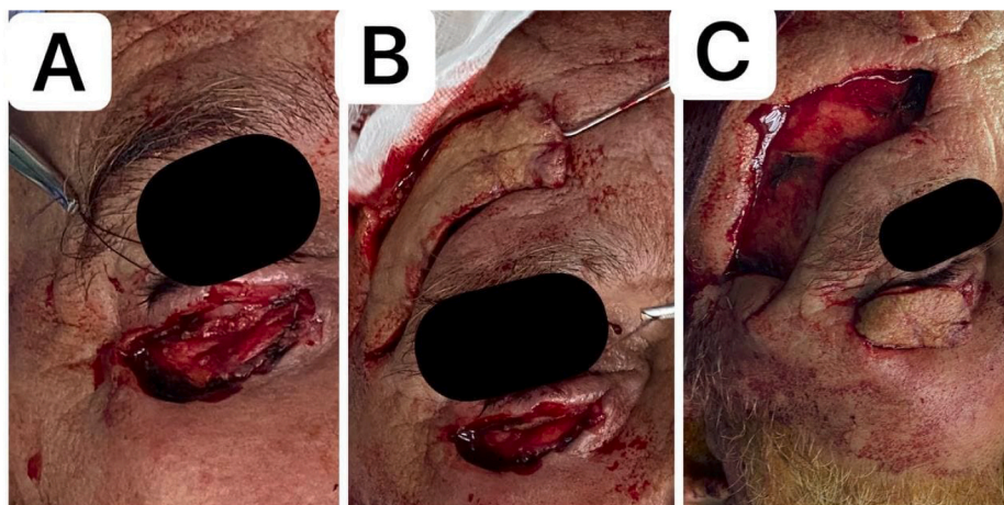
Fig. 2. The steps of reconstruction of the loss of substance.

These tumors are clinically manifested by a firm nodular lesion without pain associated with loss or distortion of the cilia in middle-aged patients [10]. It may resemble basal cell carcinoma, palpebral sebaceous carcinoma or even a Chalazion-like lesion [6,11,12]. The majority of the