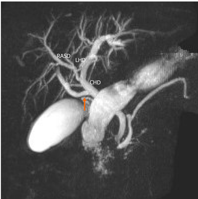
Figure 4 Type 4 variant. An aberrant right posterior sectoral duct (arrow) can be seen emptying directly into the common hepatic duct. RASD: Right anterior sectoral duct; LHD: Left hepatic duct; CHD: Common hepatic duct.

et al [36] and Champetier[53]. Each system has its individual merits. For example, some classifications[11] document the presence of accessory ducts, reportedly found in 2% [11,52] to 14% [39] of persons, while other systems do not include these data. As another example, many systems focus on biliary anatomy in the right-hemi liver[5,11,39,53] while others[3,7,13] also include detailed information on left-sided biliary anatomy.