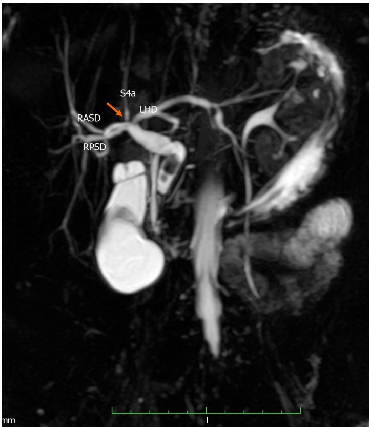
Figure 5 Undefined variant. The image shows a quadrifurcation (arrow) that is formed by the union of the right anterior sectoral duct, right posterior sectoral duct, segment IVa duct (S4a) and the left hepatic duct (LHD). RASD: Right anterior sectional duct; RPSD: Right posterior sectional duct; LHD: Left hepatic duct; S4a: Segment Iva.

variants to studies from these geographic locations. There were no published studies reporting biliary variants in West African populations but there were four studies reporting 494 variants in 876 individuals from North Indian populations[30,39,41,43]. In our population there was a significantly lower incidence of all bile duct variants than that seen in Indian populations (28.3% vs 56.4%, P < 0.001 ), probably due to decades of population mixing in our setting.