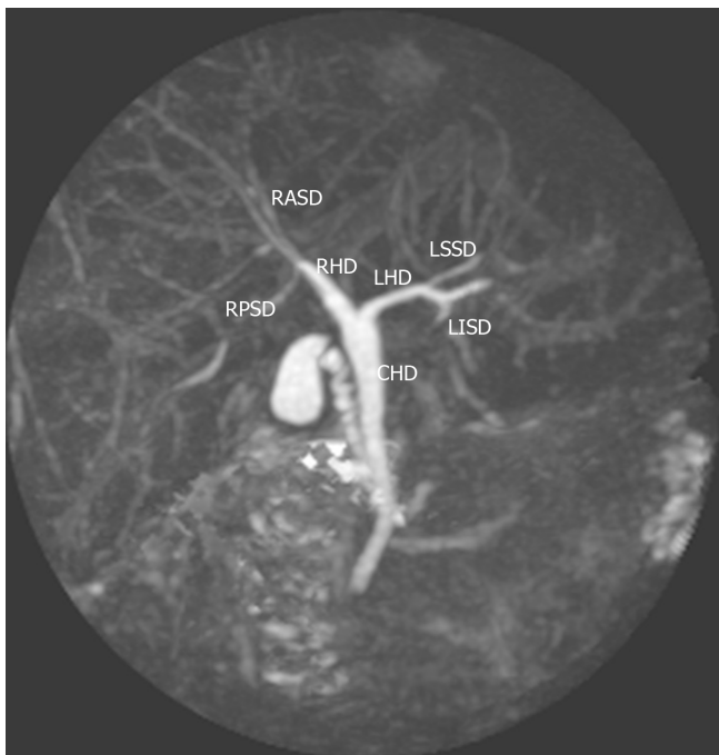
Figure 1 Type 1 (classic) variant. In this system, the right hepatic duct (RHD) is formed by two tributaries: the right posterior sectional duct that drains segments VI and VII coursing in a horizontal plane and the right anterior sectional duct draining segments V and VIII and coursing in a vertical plane. The left hepatic duct (LHD) is formed by two tributaries: the left superior sectional duct that drains segment IVa joins the left inferior sectional duct that drains segment II, III and IVb. The RHD and LHD then join to form the common hepatic duct (CHD). RASD: Right anterior sectional duct; RPSD: Right posterior sectional duct; RHD: Right hepatic duct; LHD: Left hepatic duct; CHD: Common hepatic duct; LSSD: Left superior sectional duct; LISD: Left inferior sectional duct.

RASD: Right anterior sectional duct; RPSD: Right posterior sectional duct; RHD: Right hepatic duct; LHD: Left hepatic duct; CHD: Common hepatic duct; LSSD: Left superior sectional duct; LISD: Left inferior sectional duct.