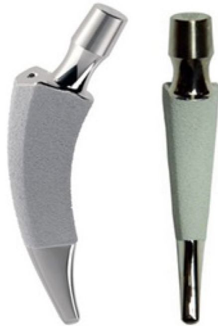
Fig. 1 The Nanos ® femoral neck prosthesis (Smith & Nephew, Marl, Germany)

Baseline demographics and clinical and radiological details were obtained a retrospective review of electronic medical records. The degree of arthrosis was assessed using the preoperative anteroposterior (AP)-pelvic and cross-lateral radiographs. The modified Harris Hip Score (mHHS),