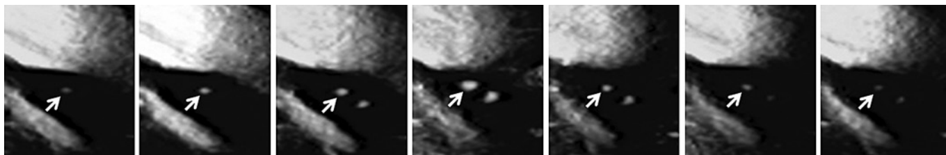
Fig. 1. SMI ultrasonograms of a 61-year-old man with symptomatic right ICA stenosis (95%) showing MES during exposure of the carotid arteries in endarterectomy. The arrows indicate IMVF signals as moving enhancements located near the surface of the plaque. The intensity of the signal becomes stronger from the left-end panel to the middle panel and weaker from the middle panel to the right-end panel.