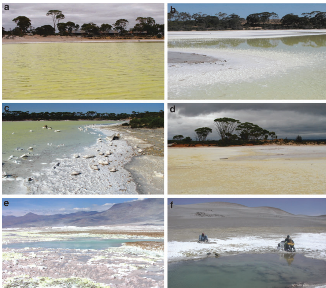
FIG. 2. Images of lakes used in this study. (a) Lake Magic near Hyden, Western Australia, on January 15, 2015. (b) Gneiss Lake, east of Grass Patch, Western Australia, on January 4, 2015. (c) Twin Lake West, near Salmon Gums, Western Australia, on January 23, 2009. (d) Lake Aerodrome, on the southern edge of Cowan Basin, near Norseman, Western Australia, on January 19, 2009. (e) Salar Gorbea, northern Chile, on March 5, 2007. (f) Salar Ignorado, northern Chile, on March 6, 2007.

Gorbea and Ignorado are composed of saline minerals hosted by volcanoclastic sediments sourced from recent eruptions of the Cerro Bayo volcanic complex. At Salar Gorbea, lake waters reach a pH value as low as 1.8 and salinity as high as 29% TDS. Lake waters at Salar Ignorado are less geochemically extreme; pH ranges from 3.3 to 4.1, and salinity ranges from 0.5% to 2.0% TDS (Benison, 2019a). Lake waters at Salar Gorbea and Ignorado are most likely evapoconcentrated hydrothermal waters that migrate upward from sub-surface magma bodies (Karmanocky and Benison, 2016).