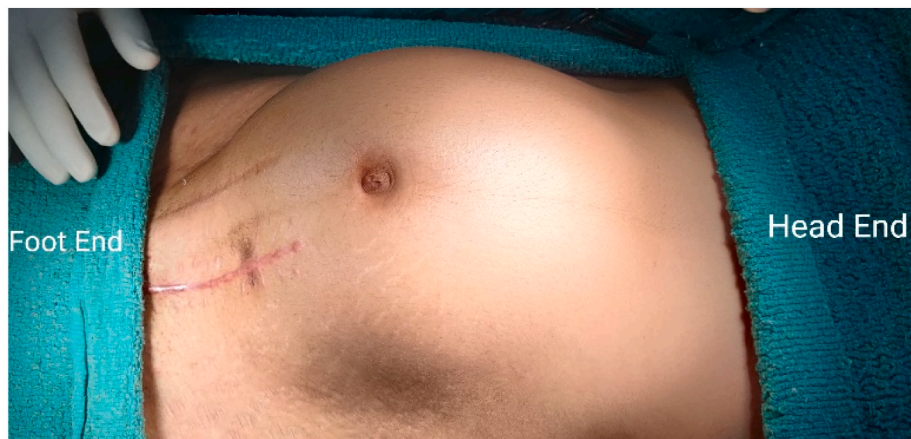
Fig. 1. Pre-op image of the large swelling in the centre of the abdomen.