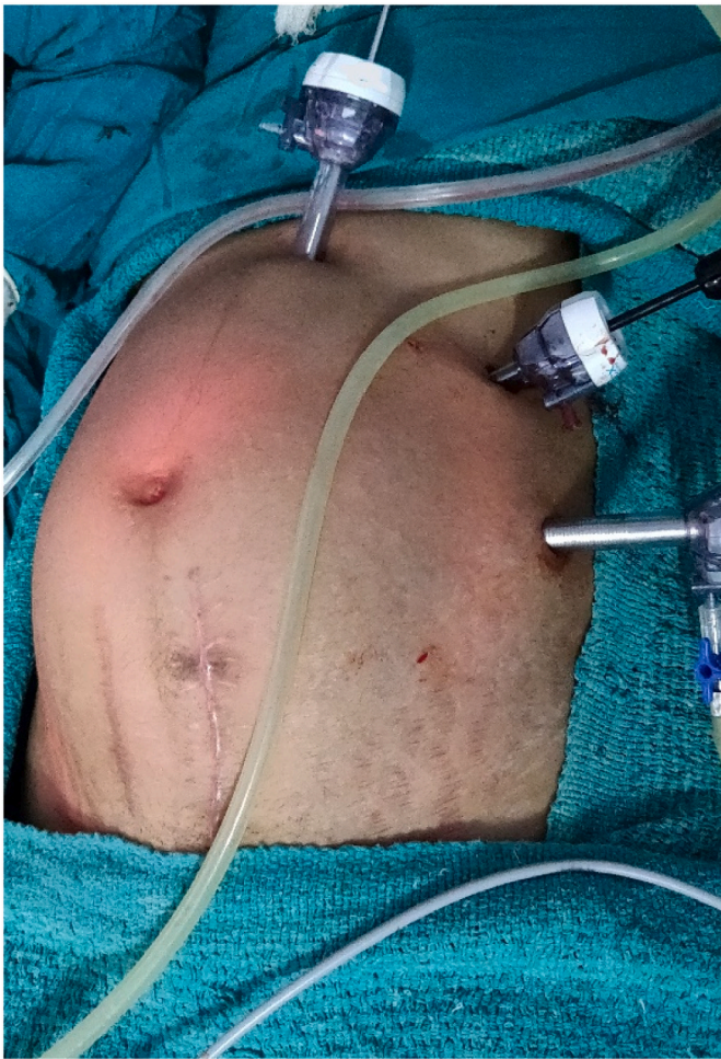
Fig. 3. Position of the laparoscopic ports.

surgeons. Wilson et al. first reported a case of gossypiboma in 1884 [7] and its incidence varies between 1 in 8000 to 18,000 abdominal surgeries [8].