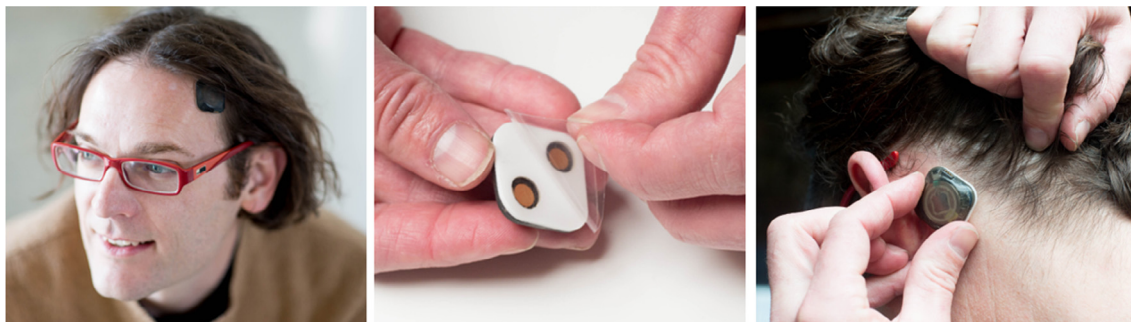
Fig. 1. Epilog sensors. The Epilog miniature wearable EEG sensor uses one-piece disposable "stickers", that are both the adhesive and conductive hydrogel that serve as the interface between Epilog and the scalp when used below hairline.

Epilog records a single channel of EEG through gold electrodes Ø6 mm, spaced 18 mm center-to-center and data is extracted from the sensor's onboard memory into the European Data Format Plus file type (EDF+). Epilog data were recorded at 10-bit, 512 Hz